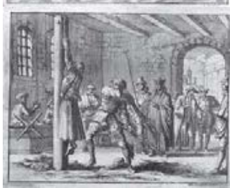
Anabaptists being burned at the stake, drowned, and tortured.