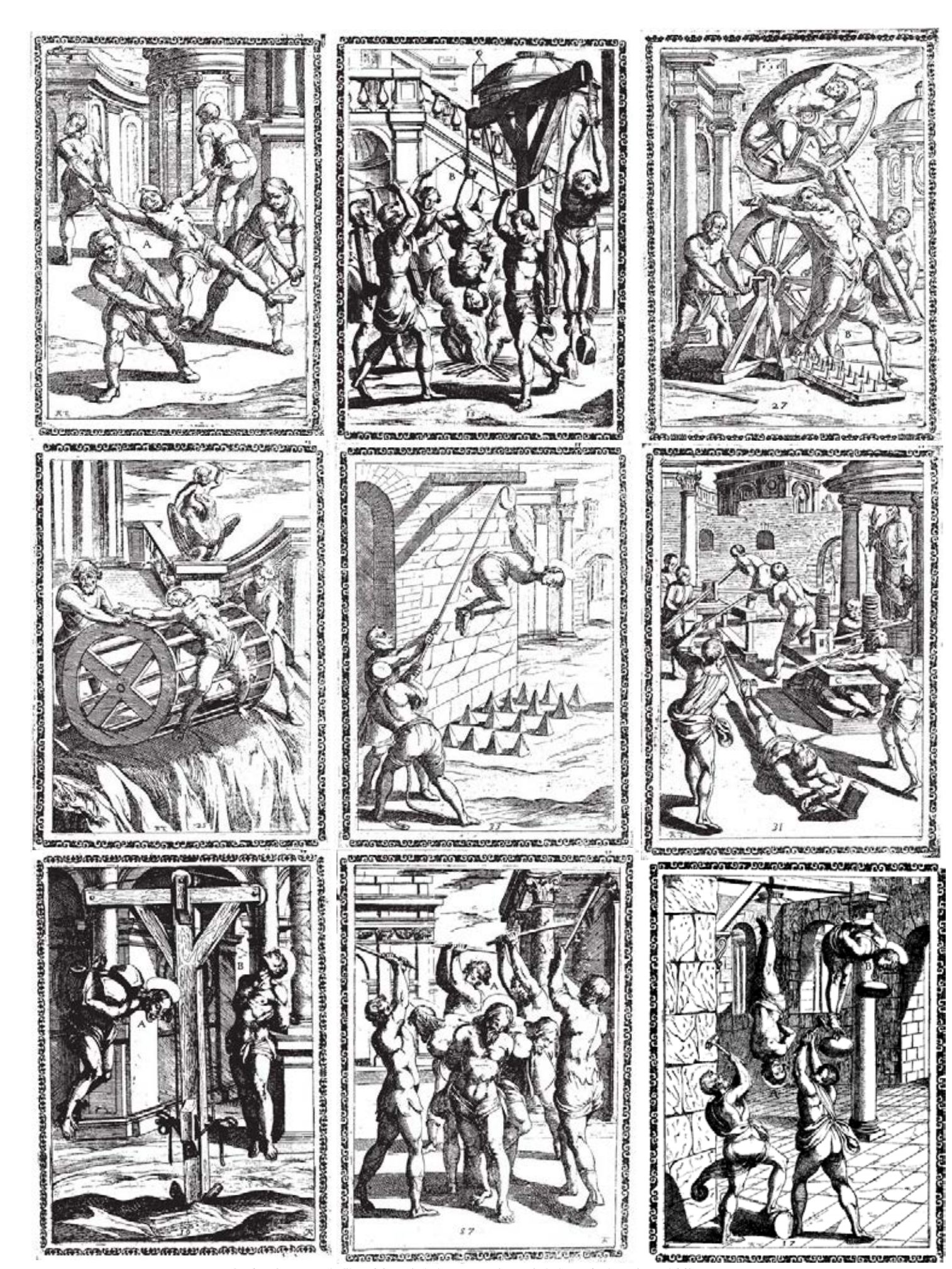
Methods of torture inflicted by Christians on other Christians during the Middle Ages.