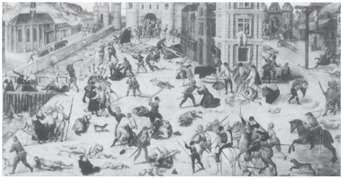
St. Bartholomew's massacre in Paris, where 10,000 Huguenots died.

<sup>1</sup>John 18:36; Matthew 26:52-54; Revelation 13:10 <sup>2</sup>Hebrews 10:26-27 <sup>3</sup>Hebrews 2:17 <sup>4</sup>John 9:39-41 <sup>5</sup>Matthew 5:38-48 <sup>6</sup>1 John 4:17 <sup>7</sup> John 18:36 <sup>8</sup>1 John 5:19 <sup>9</sup>2 Corinthians 6:14-7:1 <sup>10</sup>John 18:36 <sup>11</sup>1 John 2:15 <sup>12</sup>Luke 6:43-44 <sup>13</sup>John 13:34-35