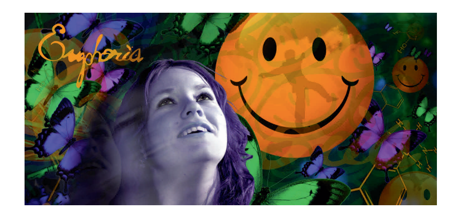
Euphoria — A strong feeling of great well-being or elation. An excited state of joy, intensely pleasurable. A feeling or activity characterized by its extreme intensity. Elevated mood. Euphoria is a desirable and natural occurrence when it results from happy or exciting events. An excessive degree of euphoria that is not linked to socially acceptable behavior is characteristic of an abnormal mental state. It can be associated with mood swings sometimes caused by intense religious experience, sexual pleasure, or drugs, etc, in which somebody is so dominated by an emotion that self-control and sometimes consciousness is lost.